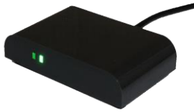
TCM3/TCM4: Readers of 13.56 Mifare or 125 KHz contactless cards