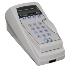
TCRS: Reader of CARTADIS magnetic cards compatible with cPad-Pay version only