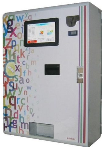
DRC10 wall version