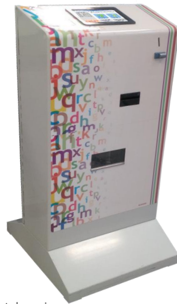
DRC10STD pedestal version

The DRC10 or DRC10STD system is an optional equipment of the Gespage solution, it is connected to the server via a TCP/IP network. It enables user accounts to be both created and reloaded but also contactless cards to be sold.