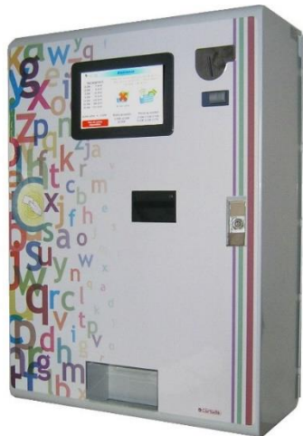
DRC10 wall version